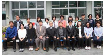
The staff and I Taiki Elementary

At lunchtime, I would head back to the classrooms to eat lunch